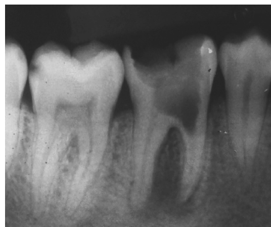
Figure 2: Preoperative radiograph revealing a periapical radiolucent lesion (26)

Studies have noted that the size of periapical radiolucency, a radiographic sign of periapical infection or inflammation ( Figure 2 ), tends to be larger in patients with diabetes compared to those without the condition. This radiographic evidence reflects the challenges posed by diabetes in achieving optimal endodontic outcomes (23).