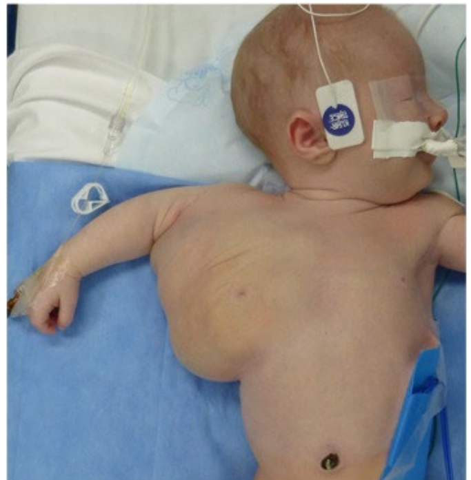
Figure 2: Case of axial lymphatic malformation (24)

When the primordial lymphatic channels fail to develop properly during embryonic development, they result in LMs, which are congenital anomalies made up of dilated lymphatic channels. They are filled with a protein-rich fluid, but they are not typically linked to the body's natural lymphatic system. Macrocystic, microcystic, or mixed lesions are possible. At birth or in early infancy, soft, nonpulsatile lumps with normal skin on top are lymphatic anomalies. Macrocystic lesions can be detected/identified during the late first trimester using prenatal ultrasonography. LMs that were not detected during pregnancy usually manifest at birth or before age two (15). The case of an axial LM is shown in Figure 2 .