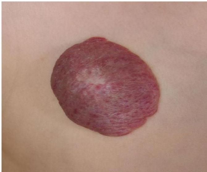
Figure 1: Typical presentation of IH (23)

involution at one year of age, with complete involution occurring in 50% of cases by five years, in 70% of cases by seven years, and in virtually all cases by 8 to 12 years of age. However, total involution does not imply total resolution. Up to 40% of IHs will still exhibit scarring and fibrofatty residuum-characterized skin alterations. Skin blanching, telangiectasia, and an erythematous macule are frequently the first symptoms of IHs. As the proliferating cells multiply, they frequently develop into elevated lesions that are bright red or strawberry in colour and have a plaque-like appearance, occasionally with centre ulceration (10). A typical presentation of IH is presented in Figure 1 .